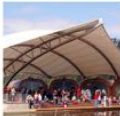
EVENT CANOPY SPACE