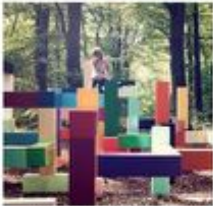
BESPOKE ARTIST / SCULPTURE PLAY