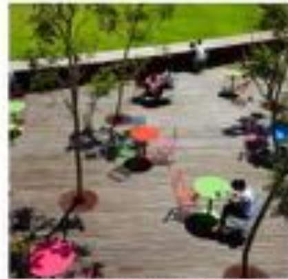
POTENTIAL FUTURE CAFE AND DINING